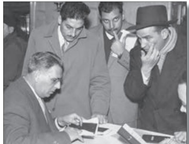
Egyptian Jews expelled from Egypt, check passports with an official of the Jewish Agency in Marseilles, France, 1957.

The largest proportion of the refugees went to Israel and was helped by the Jewish Agency. Others remained in Europe or immigrated to countries in the Americas. Italy and France also served as countries of transit