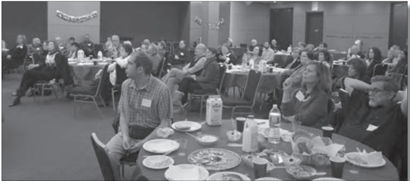
A view of the attendees at the December 2014 JGS Annual Meeting listening to the panel of experts