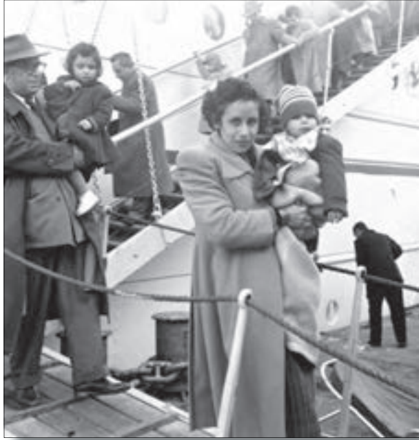
Egyptian Jewish refugees disembark from the SS Mecca in Piraeus, Greece, 1956.

passed limiting the number of minority employees that could be employed in any given business. Hundreds of Jews were arrested without cause, and the regime began a campaign forcing many Jews to leave the country and using threats to get the emigrants to sign documents saying that they were leaving of their own accord and would never return.